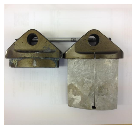
Comparison of main kingpost end fittings. 'Of the fleet currently assembled for the Youth Americas Cup, only OTUSA 4 and OTUSA 5 had the fittings shown on the right.'